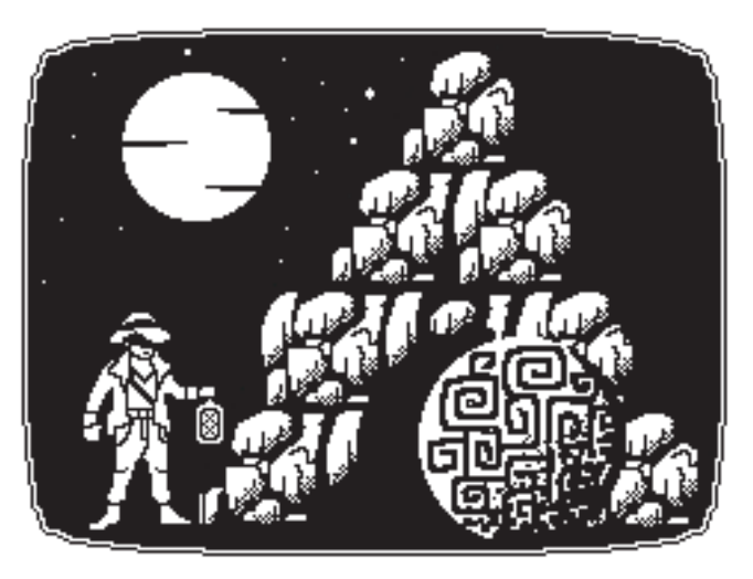
CONNECT What do Laiready know?