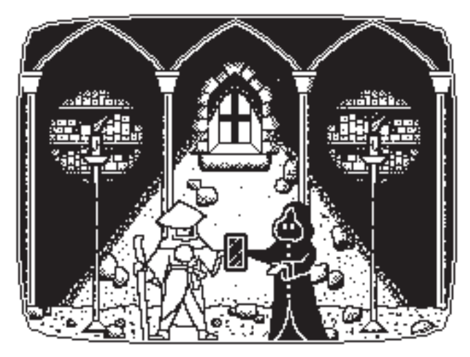
WONDER What do I want to know?